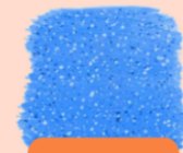
Adding texture to paint