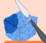
Using different tools