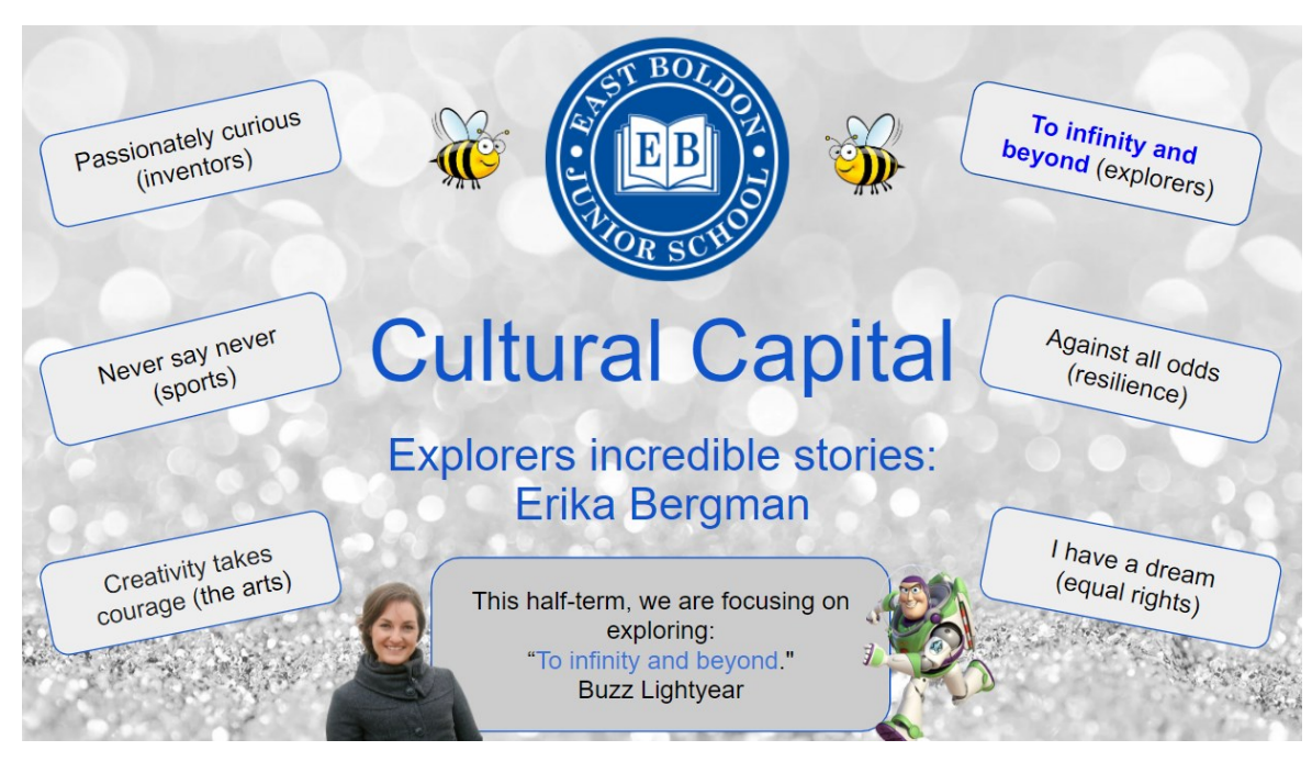
Example of one of our Cultural Capital assemblies

We have weekly Cultural Capital assemblies that raise aspiration, build resilience and widen experiences. The assemblies promote worldwide music with our weekly artist from 'Model Music Curriculum' including special events like Black History Month and Pride Week.